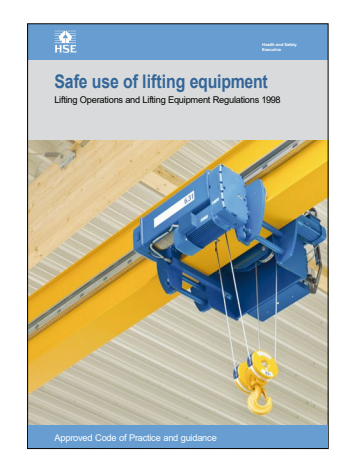
L113 (Second edition) Published 2014

This Approved Code of Practice and guidance is for those that work with any lifting equipment provided at work or for the use of people at work, those who employ such people, those that represent them and those who act as a competent person in the examination of lifting equipment.